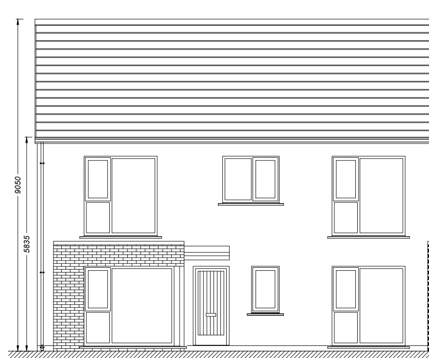
HOUSE TYPE: C FRONT ELEVATION