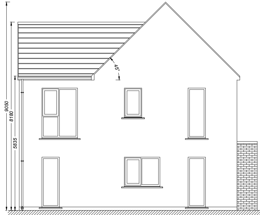
HOUSE TYPE: C SIDE ELEVATION